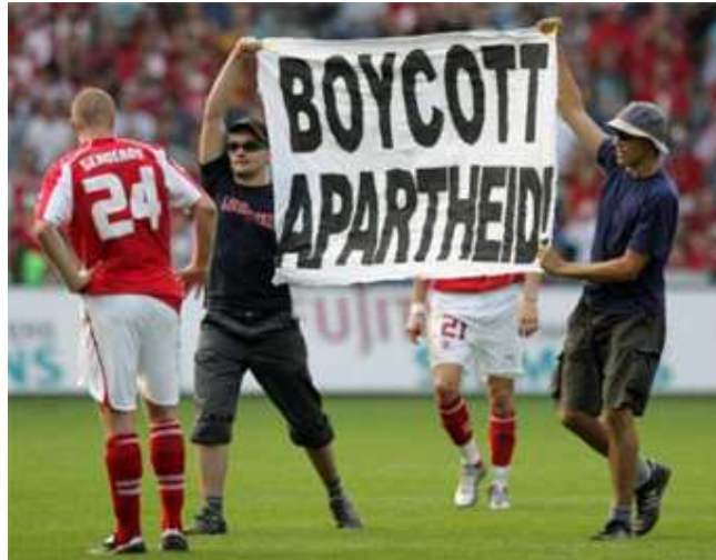
Swiss activists disrupt Israel's World Cup qualifier, September 2007